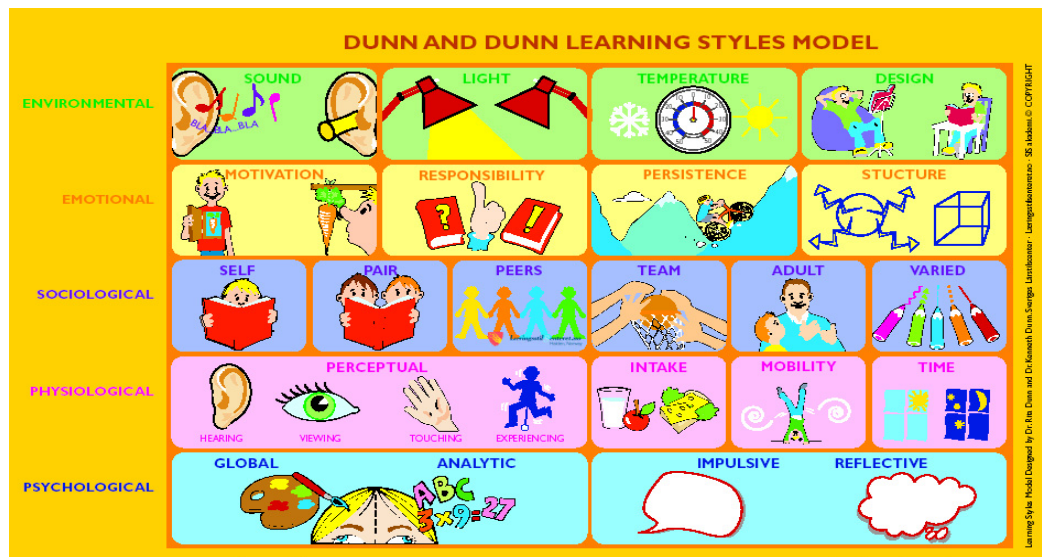
Figure 1. Dunn's Learning Styles Model in Scandinavian design

international research, been demonstrated a statistically predictable significance at the 95% level. The elements are divided into five areas (stimulus): environmental, emotional, sociological, physiological and psychological elements, which in varying degrees affect each individual. For the student it is very important to become aware of what has an effect on e.g. motivation, concentration, retention and performance, and to be able to match this with the requirements of the learning environment. This model is directly applicable to direct learning situations and should not be confused with psychological models or testing. It is not talents, personalities characteristics or attitudes; the focus is on learning that which is perceived as challenging and new.